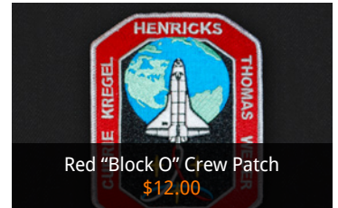
Red "Block O" Crew Patch $12.00