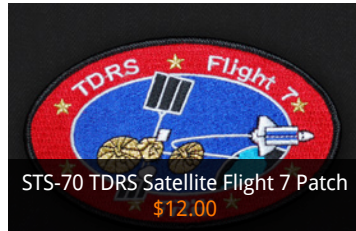
STS-70 TDRS Satellite Flight 7 Patch $12.00