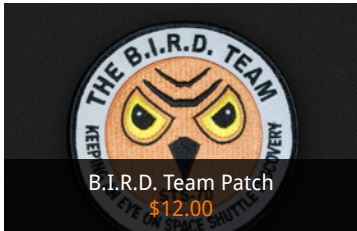
B.I.R.D. Team Patch $12.00