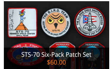
STS-70 Six-Pack Patch Set $60.00