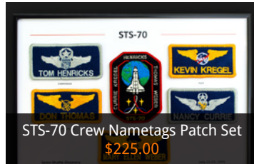
STS-70 Crew Nametags Patch Set $225.00