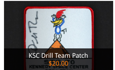
KSC Drill Team Patch $20.00