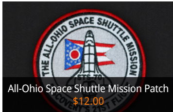
All-Ohio Space Shuttle Mission Patch $12.00