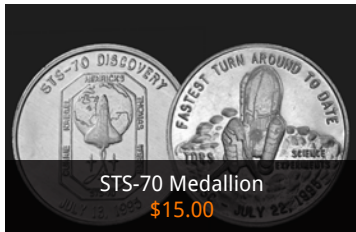
STS-70 Medallion $15.00