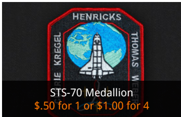
STS-70 Medallion $.50 for 1 or $1.00 for 4