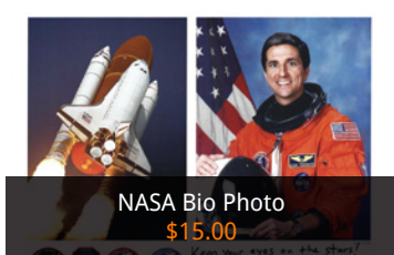
NASA Bio Photo $15.00